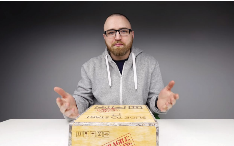
Moto E Unboxing! (Youtube 2015) by Unbox Therapy

➤ It would take more than 7 years to watch YouTube’s current stock of videos with “unboxing” in their title.