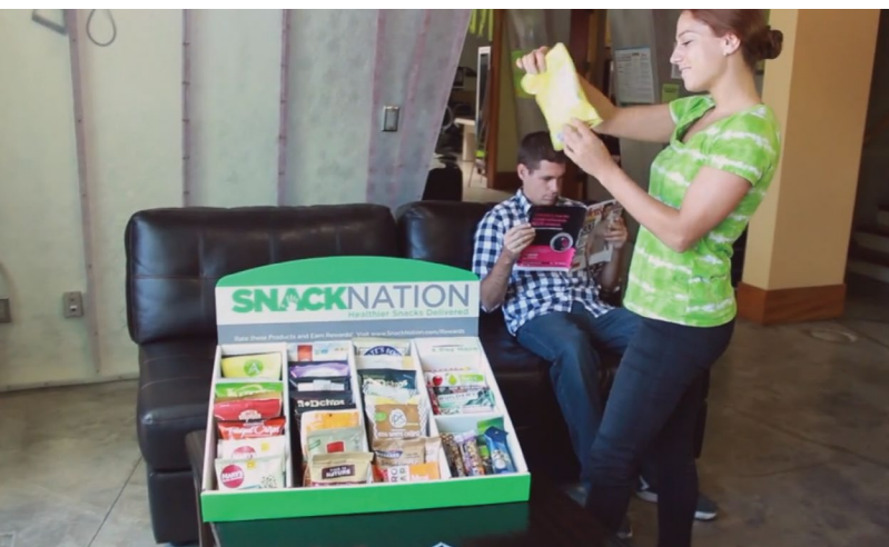
Location Review (Youtube 2014) by SnackNation